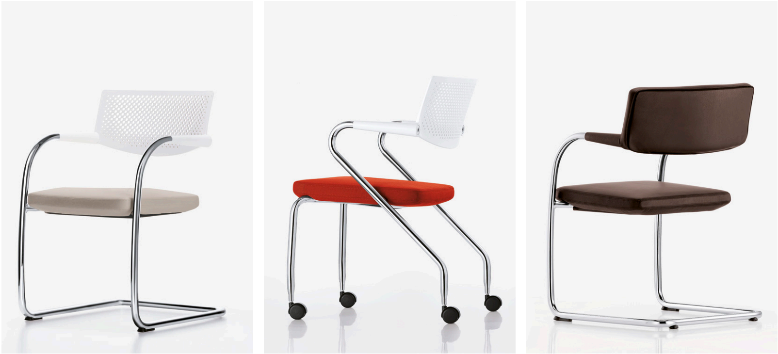
From a design perspective, the three visitor's chairs not only match one another but can also be combined with a number of other chairs.

The discreet design of the Visavis 2, Visaroll 2 and the Visavis Softback visitor's chairs makes them an ideal accompaniment to the office swivel chairs in Vitra's Citterio Collection, as well as to a wide range of other office chairs. They are suitable for use as vis-à-vis chairs in offices, as well as for general and large-scale seating in seminar and meeting rooms or auditoria.