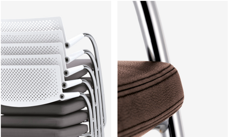
Visavis 2 and Visaroll 2 can be stacked.

The three chairs can be used in a number of different ways: The Visavis 2 can be used in a wide variety of spaces and thanks to the large choice of fabric covers and colours, it can be combined with other visitor's chairs as well. The Visavis Softback meets the high demands of prestigious design, while the Visaroll 2 is particularly suitable for spontaneous meetings and changing environments.