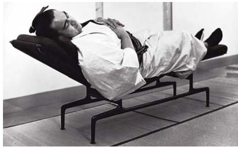
Sumo wrestler Jesse Takamiyama on the Soft Pad Chaise

The Soft Pad Chaise was designed in 1968. Its gently curving form makes it ideally suited to short periods of relaxation in the office or at home. Six cushions joined together by zip are attached to the aluminium frame, whilst two loose cushions enhance comfort.