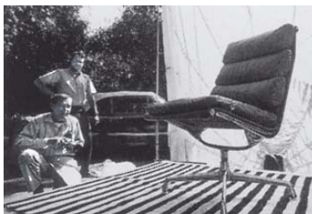
1969 Charles Eames and assistant Alex Funke taking photographs

The Soft Pad Chair was designed in 1969. In terms of construction and design it is identical to the Aluminium Chair. The attached padded sections form an interesting contrast to the elegant aluminium frame. The pads make the chair softer and more luxurious, without detracting from its transparency and clear lines.