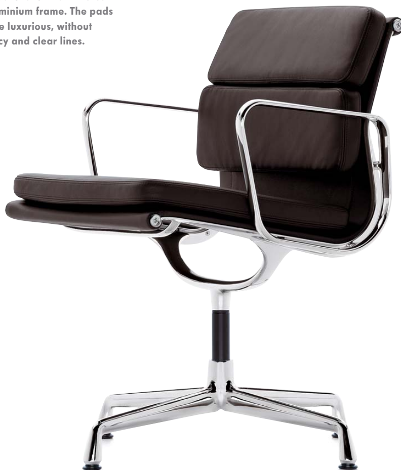
EA 207 / 208