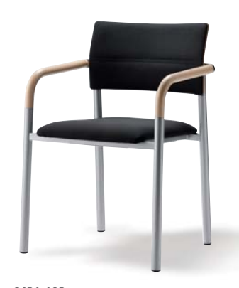
6431-102 Beech arms Upholstered seat and inner back W 56.5 / D 55 / seat height 47.5 / overall height 80.5 / height of arms 66.5