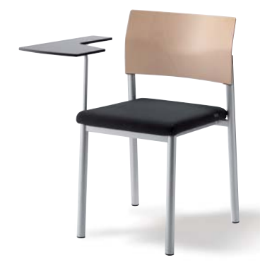
6430-111 with writing tablet 9311-000 Seat with luxury upholstery, plywood back Optional writing tablet W 48.5 / D 55 / seat height 47.5 / overall height 80.5