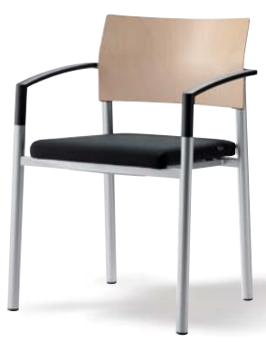
6432-111 Plastic arms Seat with luxury upholstery, plywood back W 56.5 / D 55 / seat height 47.5 / overall height 80.5 / height of arms 66.5