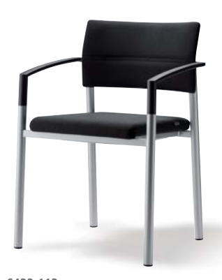
6432-113 Plastic arms Seat with luxury upholstery, back fully upholstered W 56.5 / D 55 / seat height 47.5 / overall height 80.5 / height of arms 66.5