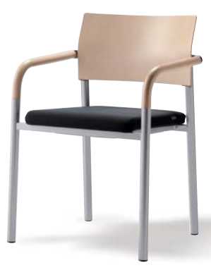
6431-111 Beech arms Seat with luxury upholstery, plywood back W 56.5 / D 55 / seat height 47.5 / overall height 80.5 / height of arms 66.5