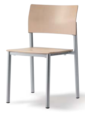
6430-100 Plywood seat and back W 48.5 / D 55 / seat height 44.5 / overall height 80.5