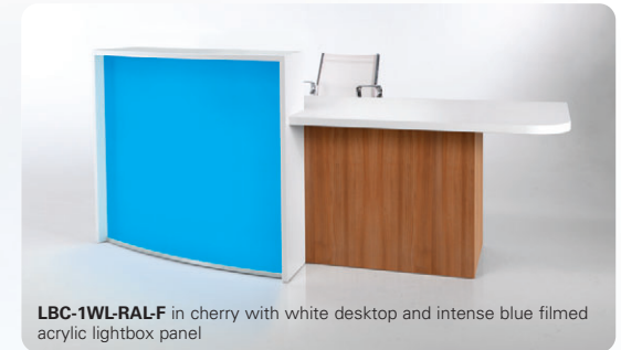
LBC-1WL-RAL-F in cherry with white desktop and intense blue filmed acrylic lightbox panel