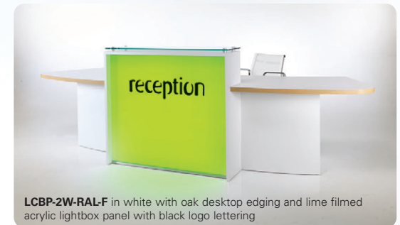
LCBP-2W-RAL-F in white with oak desktop edging and lime filmed acrylic lightbox panel with black logo lettering