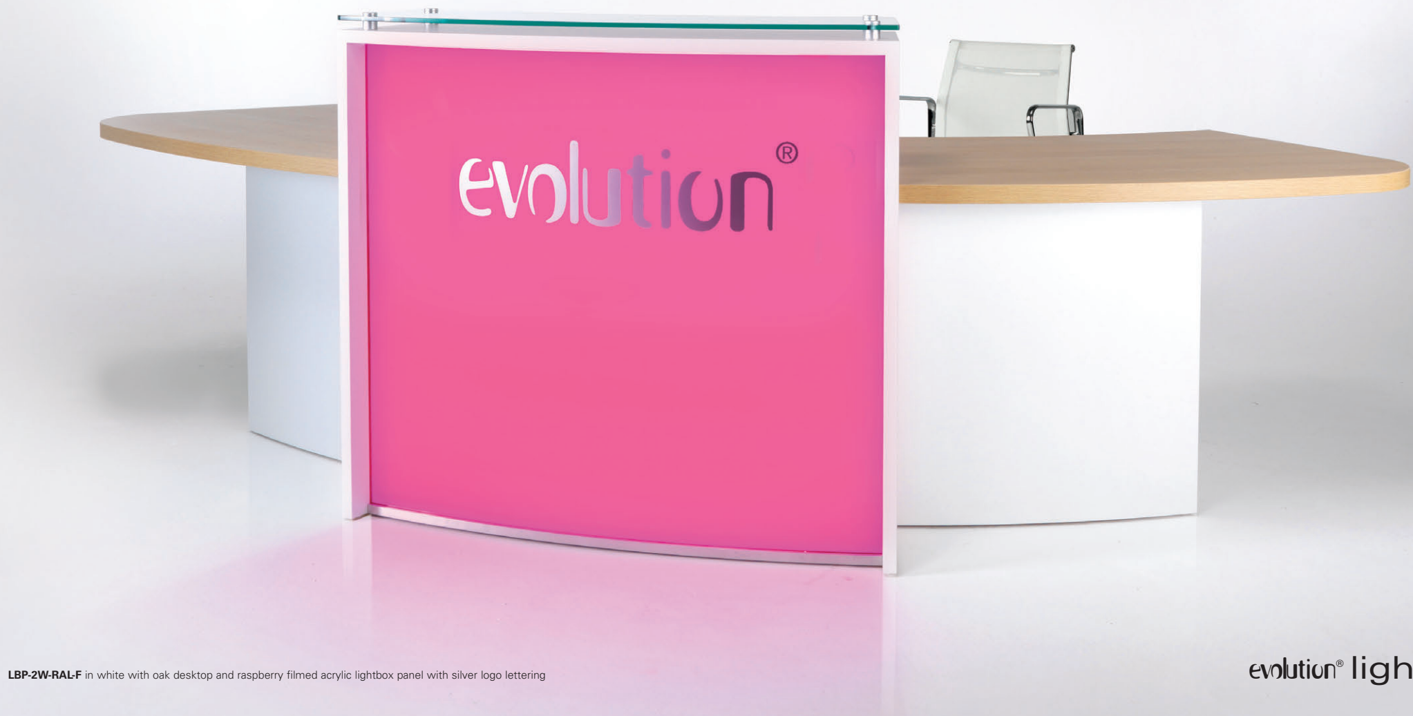
LBP-2W-RAL-F in white with oak desktop and raspberry filmed acrylic lightbox panel with silver logo lettering