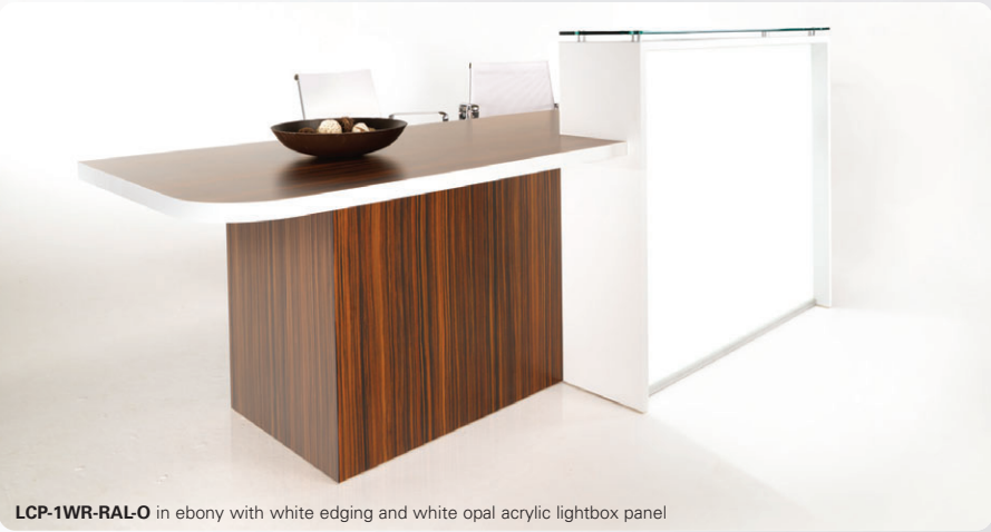
LCP-1WR-RAL-O in ebony with white edging and white opal acrylic lightbox panel