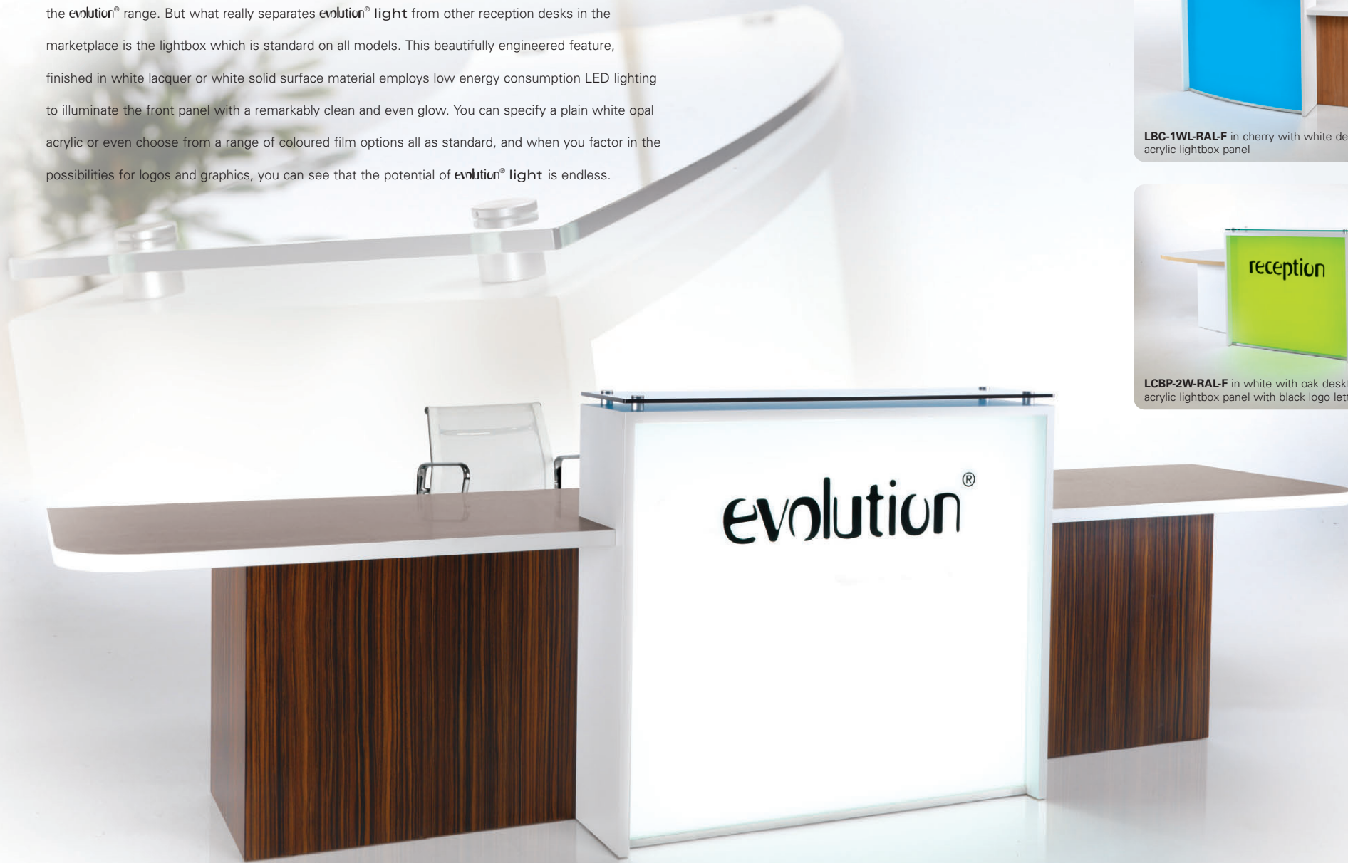
LCP-2W-RAL-F in ebony with white desktop edging and white filmed acrylic lightbox panel with black logo lettering

evolution® light is the brand new, minimally styled reception desk range from Clarke Rendall. It is available in a range of plain colour or woodgrain laminates and is a stunning, cost effective addition to the evolution® range. But what really separates evolution® light from other reception desks in the marketplace is the lightbox which is standard on all models. This beautifully engineered feature, finished in white lacquer or white solid surface material employs low energy consumption LED lighting to illuminate the front panel with a remarkably clean and even glow. You can specify a plain white opal acrylic or even choose from a range of coloured film options all as standard, and when you factor in the possibilities for logos and graphics, you can see that the potential of evolution® light is endless.