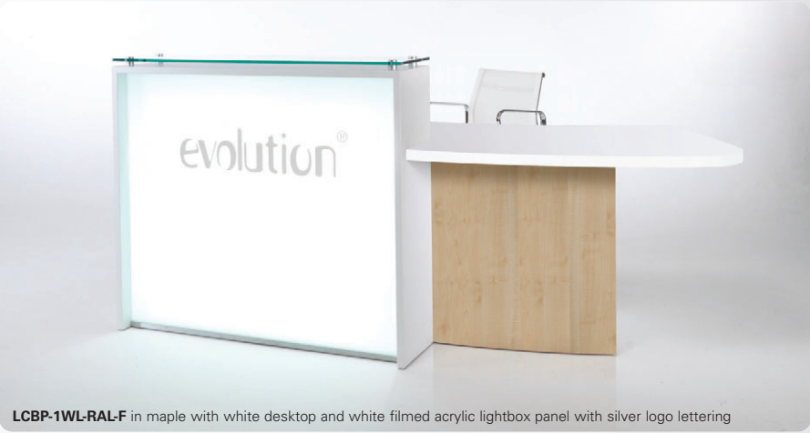
LCBP-1WL-RAL-F in maple with white desktop and white filmed acrylic lightbox panel with silver logo lettering