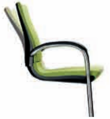
Chairs with a weight-independent movement mechanism exert a pleasant counterpressure on the user's back. The right chair for long and short meetings.