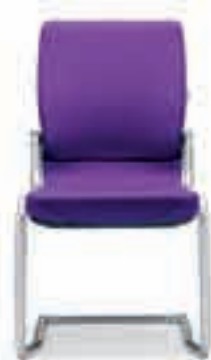
Armrests none Stacking