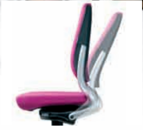
Permanent spinal contact: the user's back is optimally supported in all positions. The angle between the chair's back and seat can be adjusted to any required position. An anti-spring-back mechanism ensures smooth unlocking.