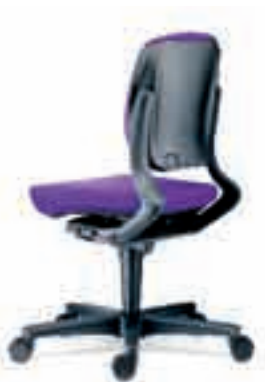
High back Plastic back shell

The chair is constructed in a modular fashion, so that the best possible chair can be compiled for every function and every person. One type of chair can be used to fit out the entire office. And it can be fitted out to your individual preferences thanks to the comprehensive range of materials, paint colours and fabrics that Ahrend offers. Carefully matched, so that all Ahrend furniture ranges can be effortlessly combined with each other.