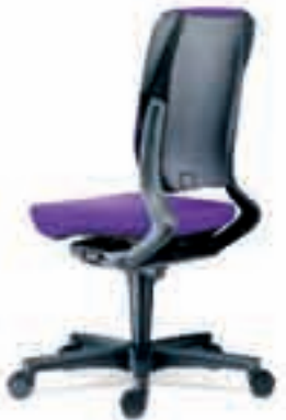
Extra high back Plastic back shell