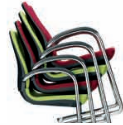
All models with or without armrests are available in stacking or non-stacking versions.

Sometimes meetings take longer than expected. At such times, sitting in a good position is important to avoid back and neck complaints. And don't forget, visitor and meeting chairs are used intensively by different people. That is why Ahrend 230 enables you to move while sitting thanks to the weight-independent movement mechanism. Tall, short, heavy or light – everybody is immediately seated perfectly.