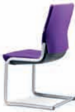
Armrests none Upholstered all round