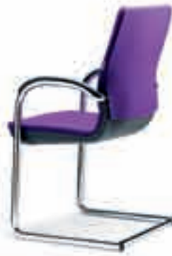
Armrests fixed Upholstered all round