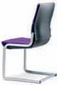
Armrests none Plastic back shell