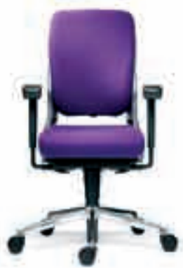
Armrests adjustable HBDD