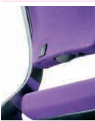
The lumbar support can be inflated using bellows.