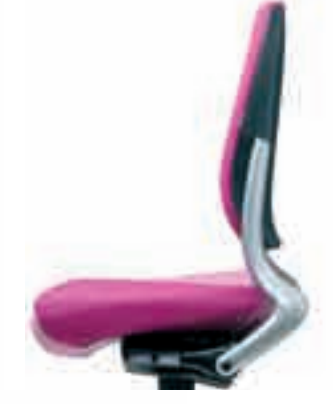
Ahrend 230 has a unique option with a tilting seat. The seat angle can be adjusted as required.