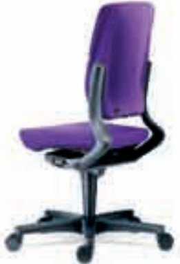
Extra high back Upholstered all round