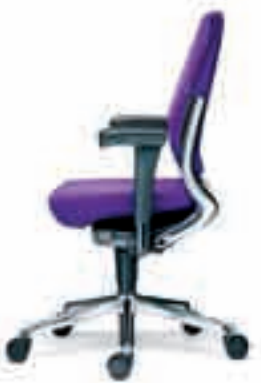
Back brackets polished aluminium Star base polished aluminium