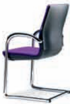
Armrests fixed Plastic back shell