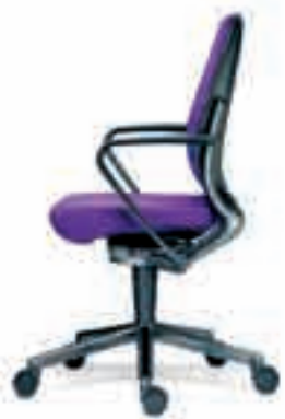
Back brackets aluminium Star base lacquered aluminium