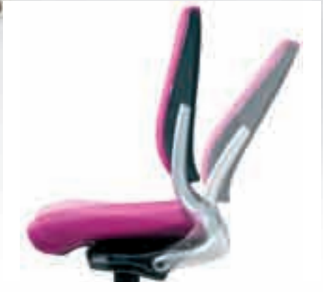
Moving while sitting with the synchro-mechanism: the back and seat move along. The spring force can be adjusted to the user's body weight and individual preferences for optimum comfort.