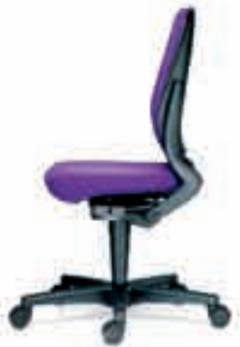
Back brackets plastic Star base soft black plastic