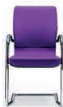
Armrests fixed Stacking