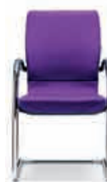
Armrests fixed Non-stacking